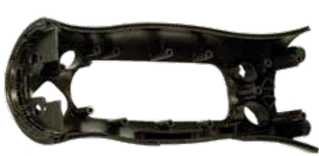
Accura ABS Black

The wide range of Accura engineered materials offers the toughest and the highest quality parts to meet a broad range of commercial and production applications.