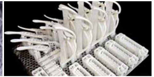
Accura Xtreme White 200