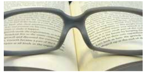
Accura Xtreme (frame) and Accura ClearVue (lenses)